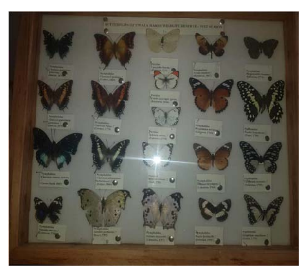
Display Box 2