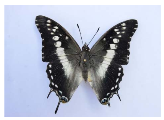
Nymphalidae: Charaxes achaemenes ♂