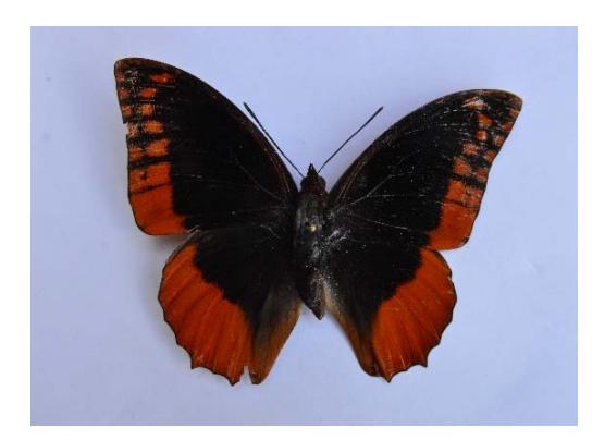
Nymphalidae: Charaxes protoclea