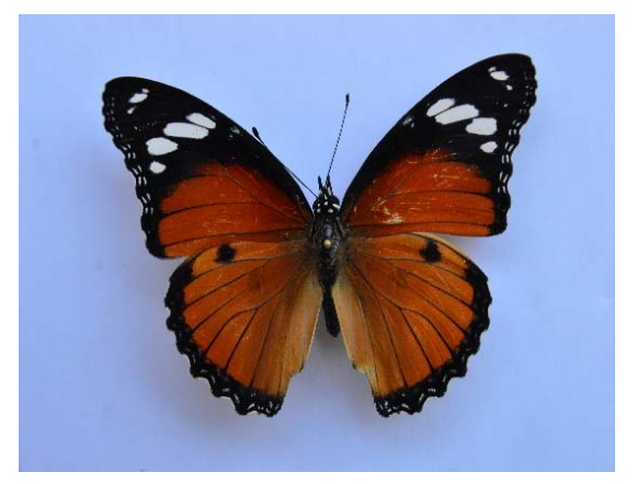
Nymphalidae: Hypolimnas misippus ♂