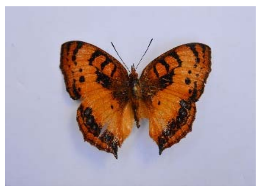
Nymphalidae: Catacroptera cloanthe