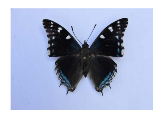
Nymphalidae: Charaxes guderiana ♂