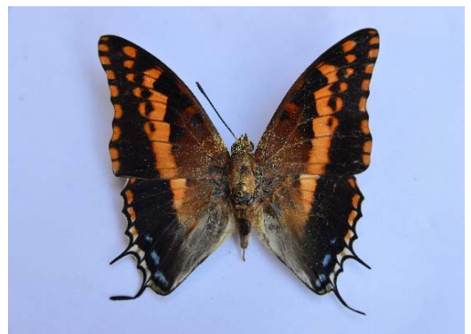
Nymphalidae: Charaxes pelias