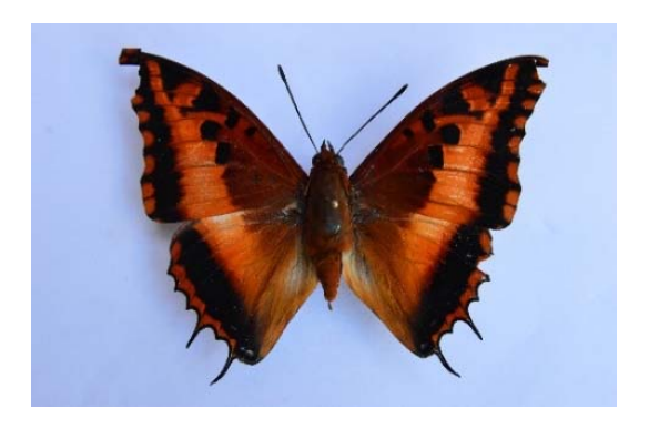
Nymphalidae: Charaxes druceanus ♂