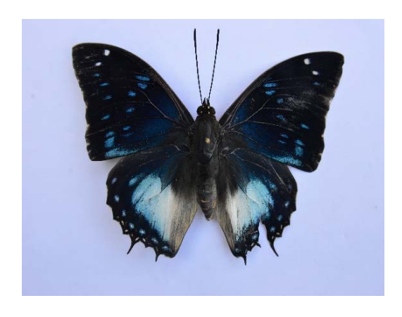
Nymphalidae: Charaxes violetta