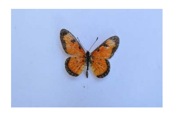
Nymphalidae: Acraea eponina