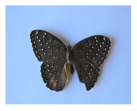
Nymphalidae: Hamanumida daedalus