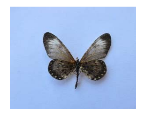
Nymphalidae: Acraea sp.