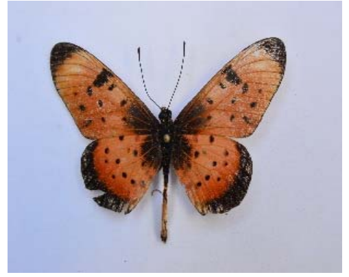
Nymphalidae: Acraea natalica