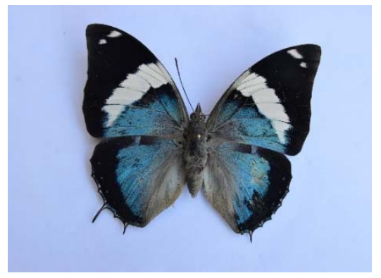
Nymphalidae: Charaxes bohemani ♂