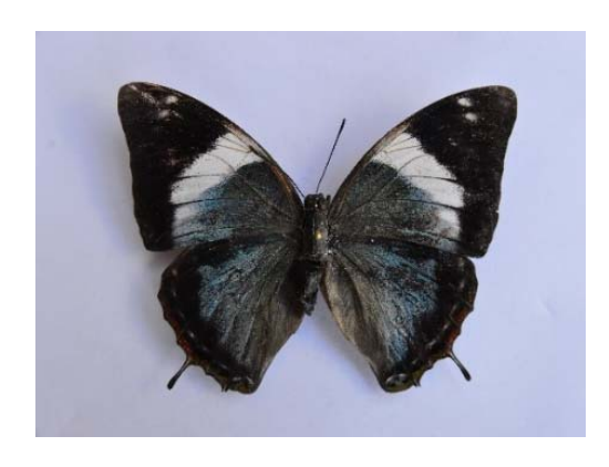
Nymphalidae: Charaxes bohemani ♂