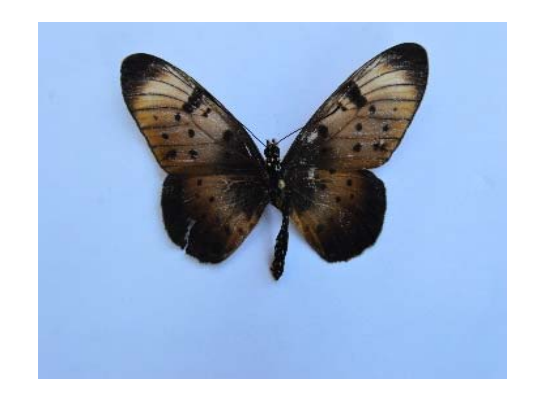
Nymphalidae: Acraea natalica