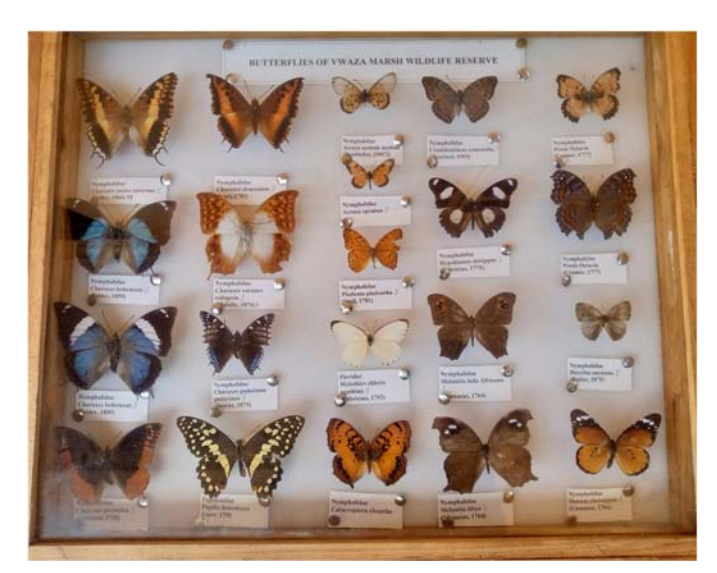
Display Box 1