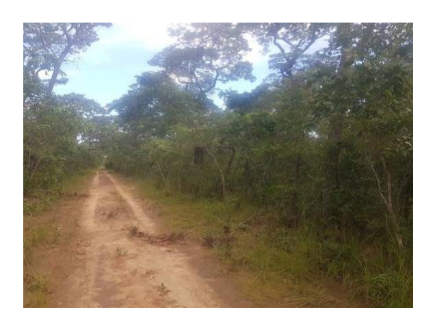
Transect for butterfly traps