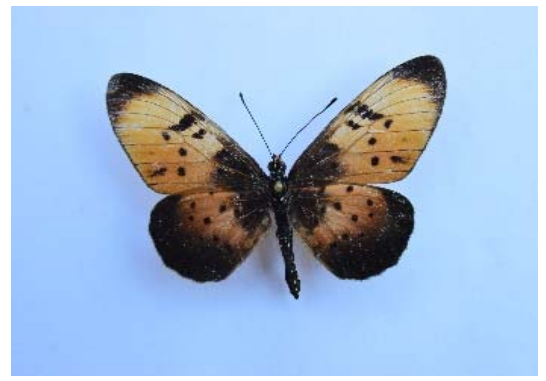
Nymphalidae: Acraea natalica