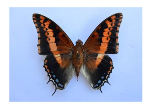
Nymphalidae: Charaxes pelias \sigma