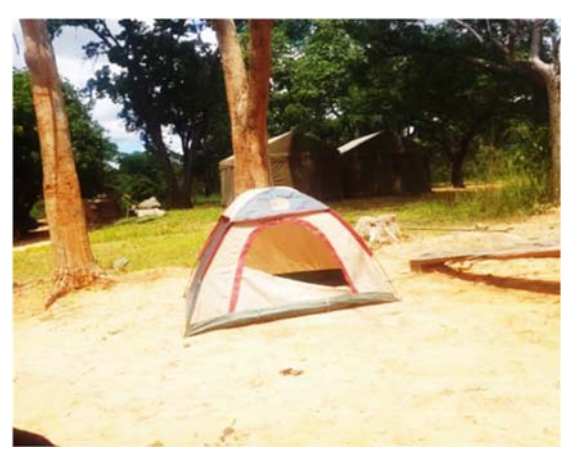
Tent pitched at Kawiya