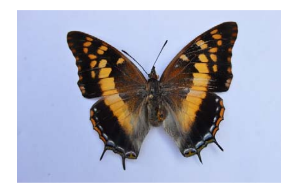
Nymphalidae: Charaxes guderiana ♀