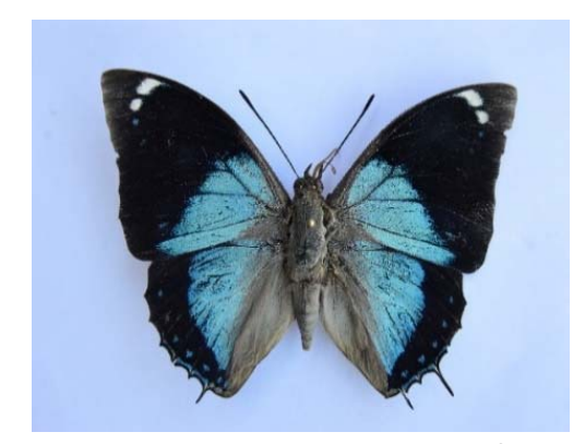
Nymphalidae: Charaxes bohemani ♀