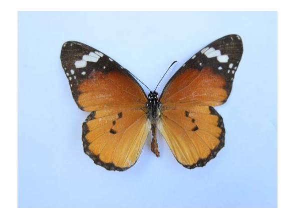
Nymphalidae: Danaus chrysippus